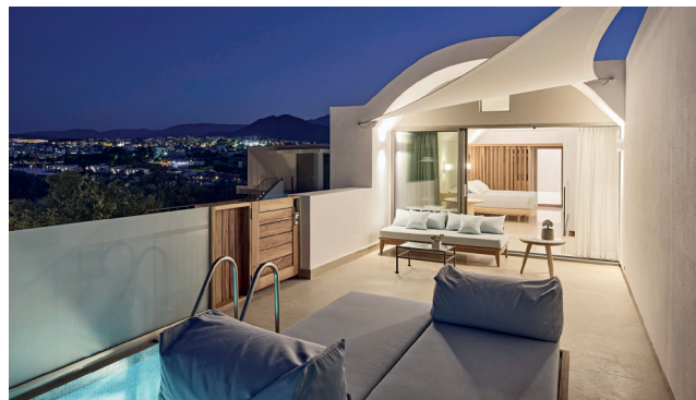
New Olives and Sea Suite Two Bedroom Private Pool Harbour View/Sea View.