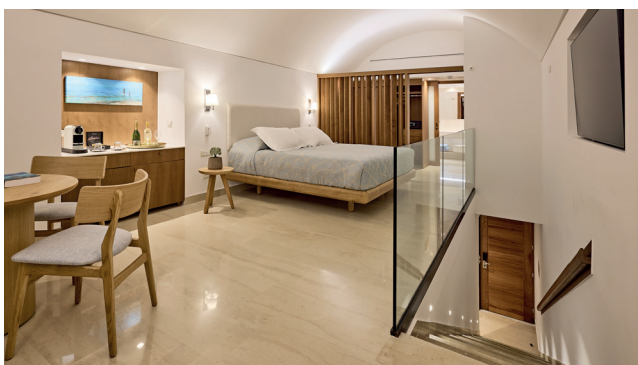
Interior - Olives and Sea Suite Two Bedroom Private Pool Harbour View/Sea View.