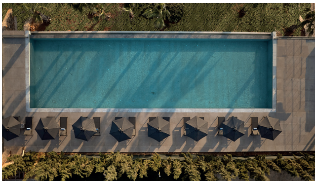
Olives and Sea Adults Only Pool - Aerial View.