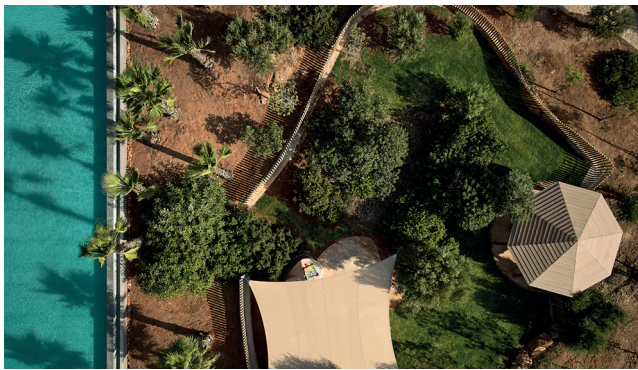
New Semi-Open-Air Children's Playground – Immersed in Nature.