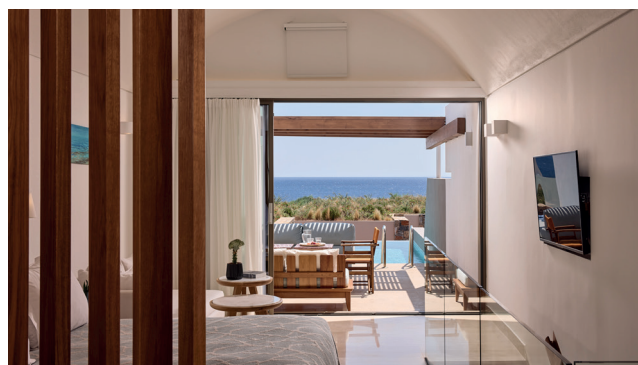
Interior View - Olives and Sea Suite Two Bedroom Private Pool Harbour View/Sea View.