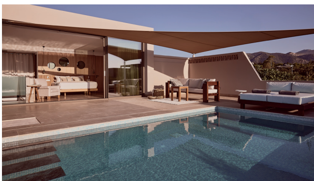
Olives and Sea Suite Two Bedroom Private Pool Harbour View/Sea View.

Step into the extraordinary realm of 'Olives & Sea' at St Nicolas Bay Resort Hotel and Villas. With its impeccable craftsmanship and thoughtful integration with the environment, your journey promises a seamless blend of luxury and authenticity. Embrace a world where sophistication meets serenity, where every detail respects the natural surroundings, and where cherished memories are waiting to be made.