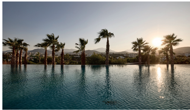
Introducing New Olives and Sea 25 meter Adults only pool with beautiful vistas towards the mountains and Agios Nikolaos town. Enjoy lap swimming, aqua aerobics or simply relax under the sun.